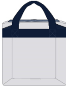
Bag that is clear plastic, vinyl or PVC DOES NOT EXCEED 12" X 12" X 6"