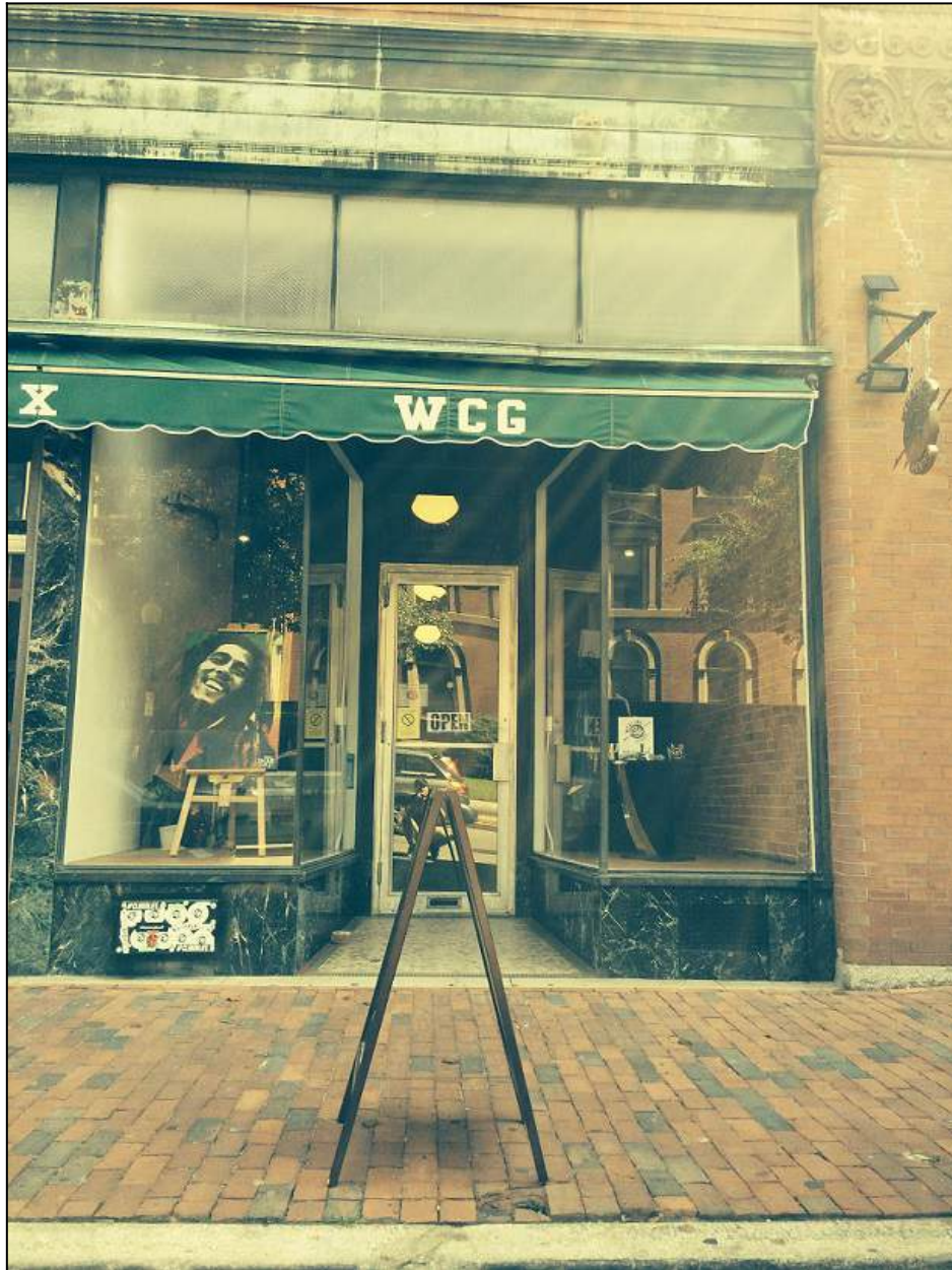
Whaling City Glass – Smoke Shop located at 634 Pleasant St, New Bedford: 508.717.4207.

Pipe smoking is a centuries long tradition practiced over most of the known world. The first Europeans to arrive in the New World came upon Amerindians smoking bowls of packed tobacco. While they typically used the pipes for ceremonies, Europeans quickly took to the activity, albeit making it a leisurely