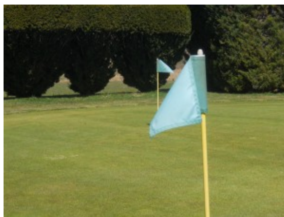
The putting green at Rochester Golf Course.

Trees line most of the holes and squeeze the fairways, making tee shots more difficult. Add to that the water or sand elements scattered throughout the grounds and you're left with some truly challenging holes. Even on holes with open fairways, the shots seem claustrophobic. By the time you reach the 3rd green, you realize how precise you need to be with your shots, especially your irons. Driver is not always the best choice off the tee, making players use all the clubs in their bag. Big hitters cannot depend on bombing one down the fairway, and this alters the way many people play. Shot planning is also essential, because there are many areas on many holes that just aren't conducive to scoring well.