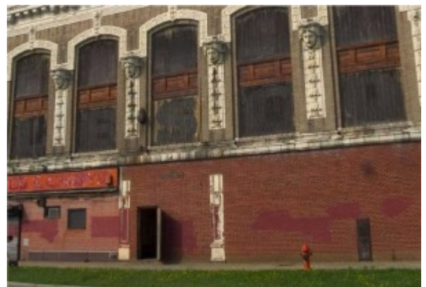
4 masses in New Bedford (artist unknown)