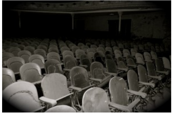
The original seats still fill the Orpheum Theatre.

Of course, there is much work to be done and the support of the community at large, as well as other civic and preservation organizations, will become even more important in the near future. Far too often we have heard that ours is a pipe dream; an impossible project that has no chance for success. The way we look at it, if nothing is done, nothing happens. There is always the possibility of failure with any venture in life, large or small. However, doing nothing at this point just guarantees that failure.