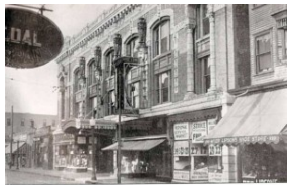
New Bedford Orpheum Theatre and French Sheepshooter's Hall Photo taken 1941

In its original configuration, The Orpheum was built as a 1,500 seat Vaudeville house. The theatre also began to show films when movies eventually eclipsed live performances in popularity. The theatre was part of the original Keith-Albee Circuit and featured many great performers during its heyday. It opened the very same evening the RMS Titanic was steaming toward her tragic end.