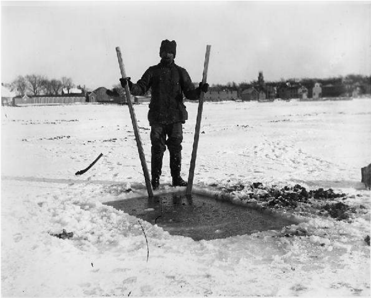
Quahogging on the Acushnet River

However, as early as 1899 the local Board of Health had declared that going for a dip would be detrimental to your health. It would have taken decades for it to get to that point. New Bedford's sewer pipes had been dumping directly into the river for years and caused a sort of karmic revenge in the form of a Typhoid Fever break-out infecting 575 people and killing 93 from eating shellfish. The Board of Health went from "Don't swim there." to "Don't swim or eat from there." In 1904 they closed the river to swimming, shellfishing, and fishing. Geez. Great timing fellas.