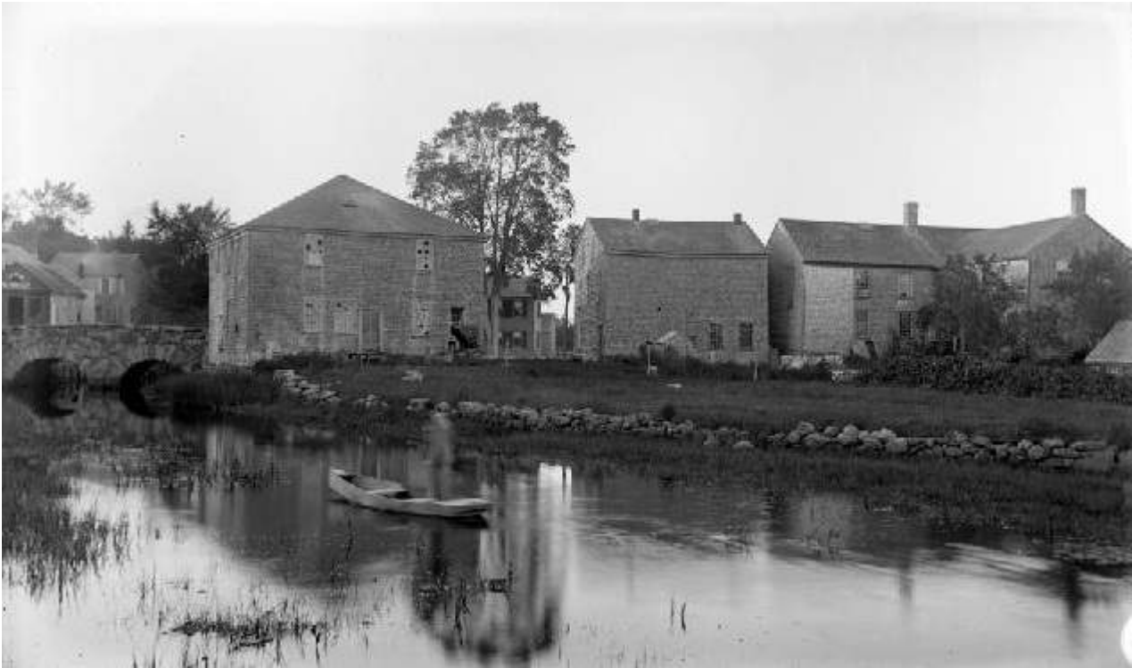
Head of the Acushnet River aka River's End

Beyond the local and immediate needs that water served, to go further into to the interior, water was the highway. Shrubbery, forest, undergrowth, animals and natives were a barrier. Rivers were yesterday's highways. You were on the water you needed to function and survive. You didn't have to hack, hew and labor through dense forest, burning precious calories along the way. Animals could thoroughly be avoided. While Natives could not be avoided, there was a buffer of distance providing some safety. One could only be ambushed at a fair distance.