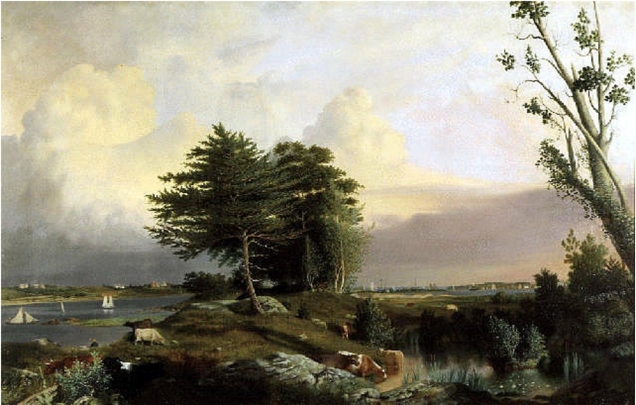
View Down A River (1853) by William Allen Wall

Through interaction, particularly trading with the Cushenas, the earliest European settlers heard variants of words that contained the sound “cushen” when discussing the people, river, and land. It was only a matter of time before, Europeans would pick up the word and as normally happens with adopted words they become corrupt.