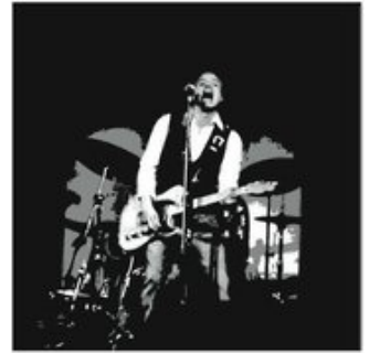
The J. Kelley Band plays at Down The Hatch Friday and Ice Chest on Sunday.

Sunday is the very last day to enjoy the South Coast Artist's Open Studio Tour 2011. Be sure to take advantage of this opportunity to support local artists.