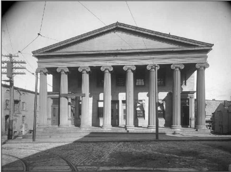
The "Double Bank" Building shared by Mechanic's Bank and Merchant's Bank.