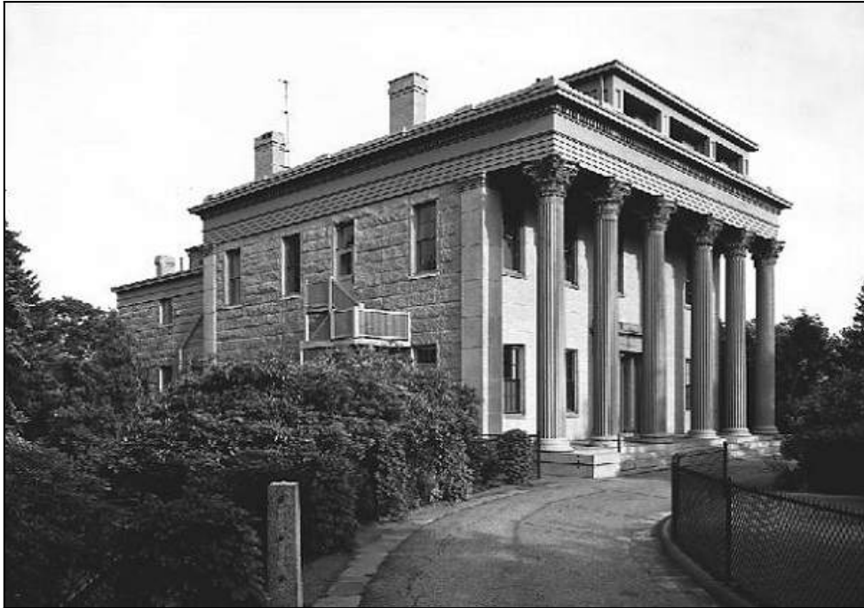
Rodman Mansion – One of America’s most expensive homes in the 1830s.

thing in renovating the building before turning it over to the National Park Service.