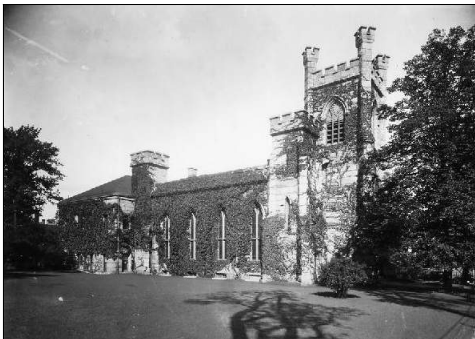
The First Unitarian Church, built in 1838.

as far is known there are no major “unintentional” differences. However, I have come across documents that mention the rivalry between the two institutions continued after the building was erected. When one bank would beautify their half, the other half would attempt to outdo them, and so they dueled until the two banks eventually left this Greek “Ionic temple” in the early 1890’s. Heavens to Betsy.