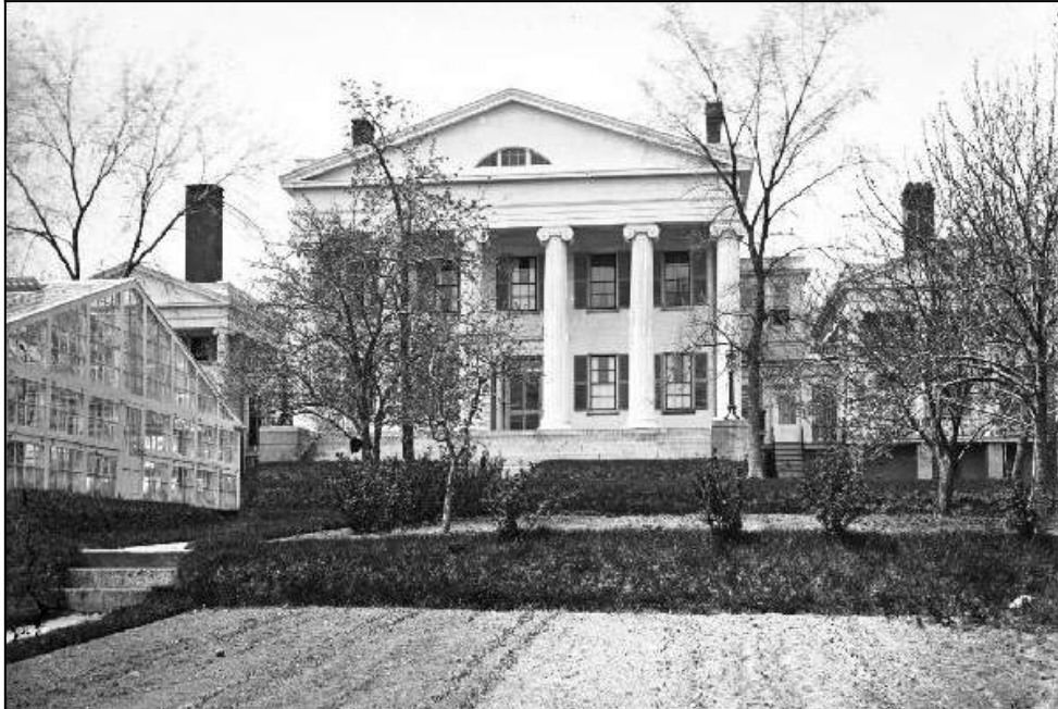
The John Avery Parker Mansion built in 1834.

became the New Bedford Jewish Federation's community center. In 1972 it went to the Swain School of Design, and finally its last owner William Rodman Partnership in 1988.