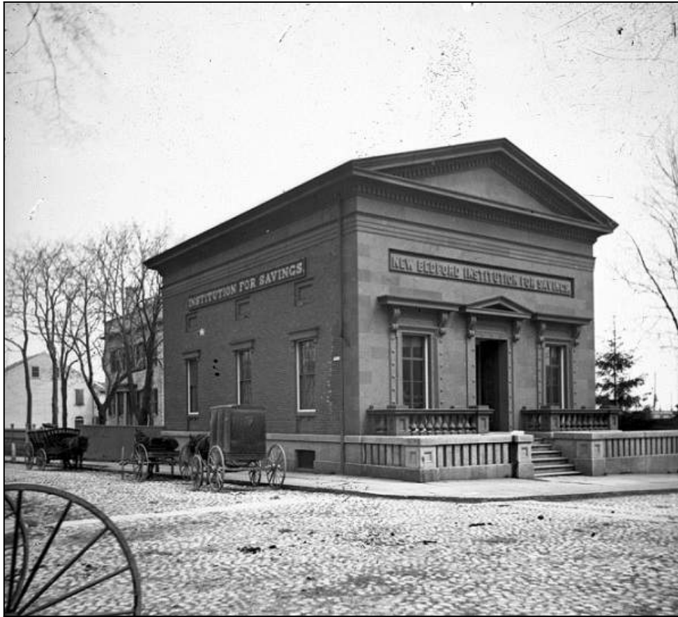
The National Institution for Savings before it was owned by the NPS.