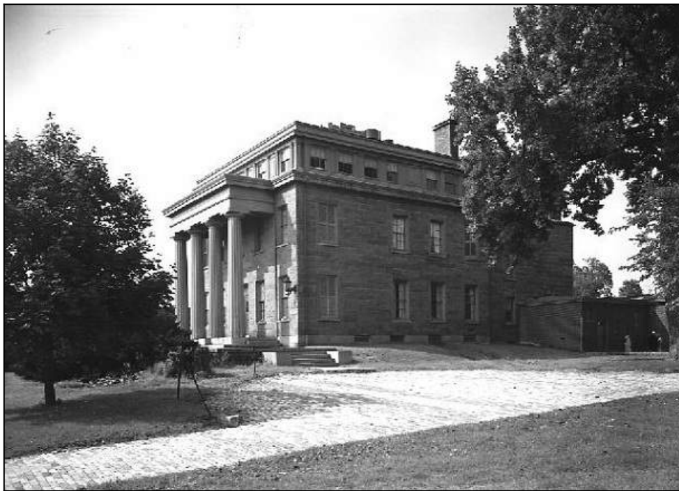
The Joseph Grinnell Mansion at 379 County Street (New Bedford Whaling Museum Photo).

granite. The church itself was established in 1708 in "Olde" Dartmouth, before making its way to the corner of Purchase and William Street in 1824 as the First Congregational Society of New Bedford. In 1868 a chapel was attached to the church which served as a meeting house and Sunday school. In 1874, she underwent some major renovations. In 1896, the Parish House was built in the rear. The Whaling Museum currently possesses original plans.