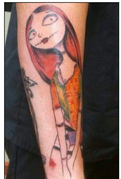
Ruby Red Ink has a

In fact, I believe it's human nature. People are always chasing the next rush or buzz – even though they are painful experiences and will probably lead to injury or potentially death. We climb mountains, jump out of planes, do Tough Mudder events, take up martial arts, etc. These outlets serve society in that these activities serve as an outlet, and for some they would be using other outlets to get their rush or buzz – namely criminal or drug-related behavior. Life can be all the high you need.