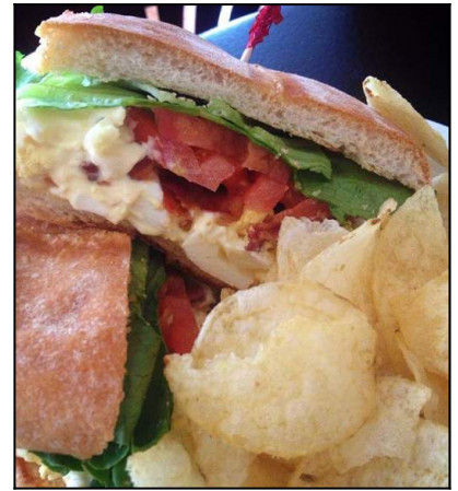
Tia Maria's European Cafes BELT: Bacon, Egg Salad, Lettuce & Tomato!

offer outside seating, and I was able to indulge in great food from another culture especially when I tried their Turkey Reuben with their own homemade dressing.