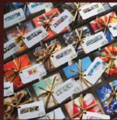
Pebble Cove Décor