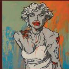
Bolt Gun Gallery