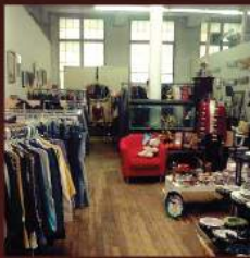
New Bedford Negotiables