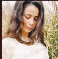
J MaC Studio & Design