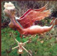
H.B. Eadie Coppersmith