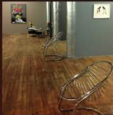
Colo Colo Gallery