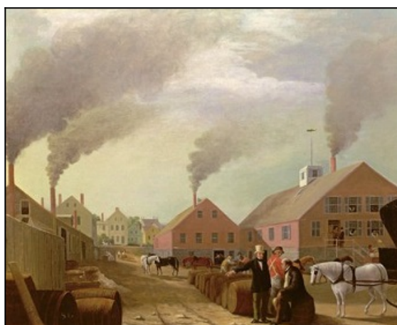
Leonard Oil Works by William Allen Wall – Courtesy of N.B. Whaling Museum

lots to the waterfront, it began to attract fisherman, shipbuilders and the ilk. At that point, New Bedford included Acushnet and "Fair Haven" until they broke away in 1860 and 1812 respectively. As the village began to develop, the officials decided to make a distinction between another Bedford that was already established in Massachusetts and of course, the Bedford that already existed in England. New Bedford grew into a town and was officially granted its' charter in 1787. This is how New Bedford, got its "New." Faster, stronger, higher.