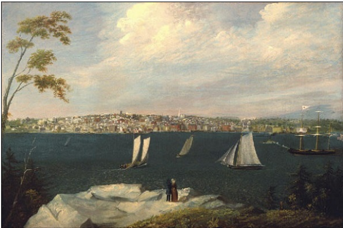
View of New Bedford from Fairhaven circa 1848 by William Allen Wall – Courtesy of N.B. Whaling Museum

This was another village with next nothing about it. The only name that pops up is a gambling man by the name of Ed Winter and a short Winter Street which is the Rural Cemetery. This street has approximately 6 houses now.