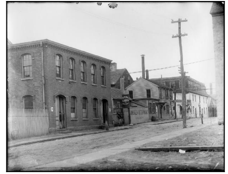
N. Water St. from Ark Lane (Whaling Museum)

It was during this time that one neighborhood in particular stood out for these exact characteristics. The neighborhood was called the "Hard Dig" and centered where Kempton Street would meet the waterfront, if Route 18 and Route 6 weren't there. Water Street, and the streets called High Street and Charles street that are no longer present, were also streets that were part of the "Hard Dig." High Street met at the foot of today's Fairhaven/New Bedford Bridge. While High Street and Charles street have separate names, High Street was technically an extension of Charles Street. This street ran parallel and south of Kempton Street.