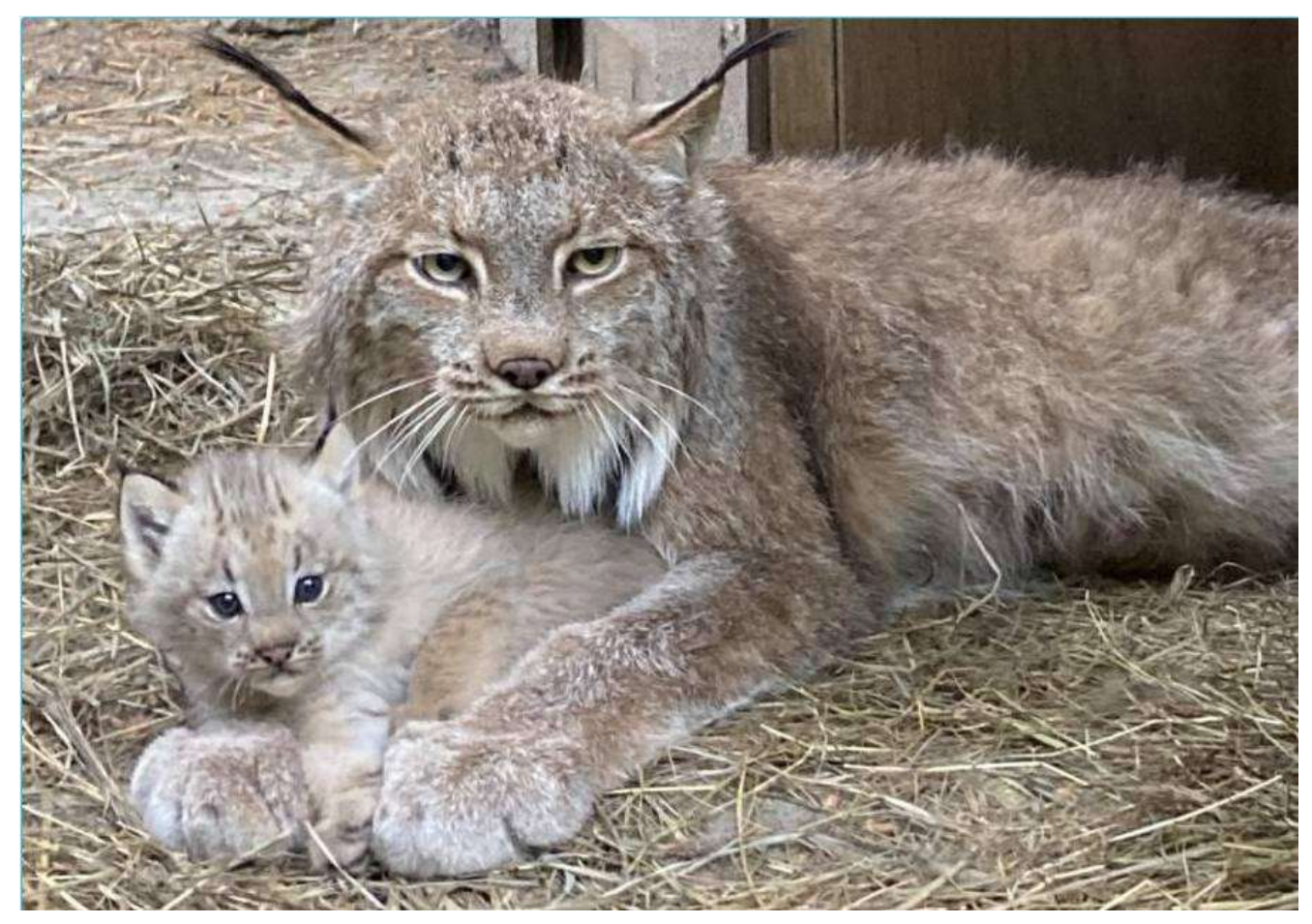
BP Z00 photo.