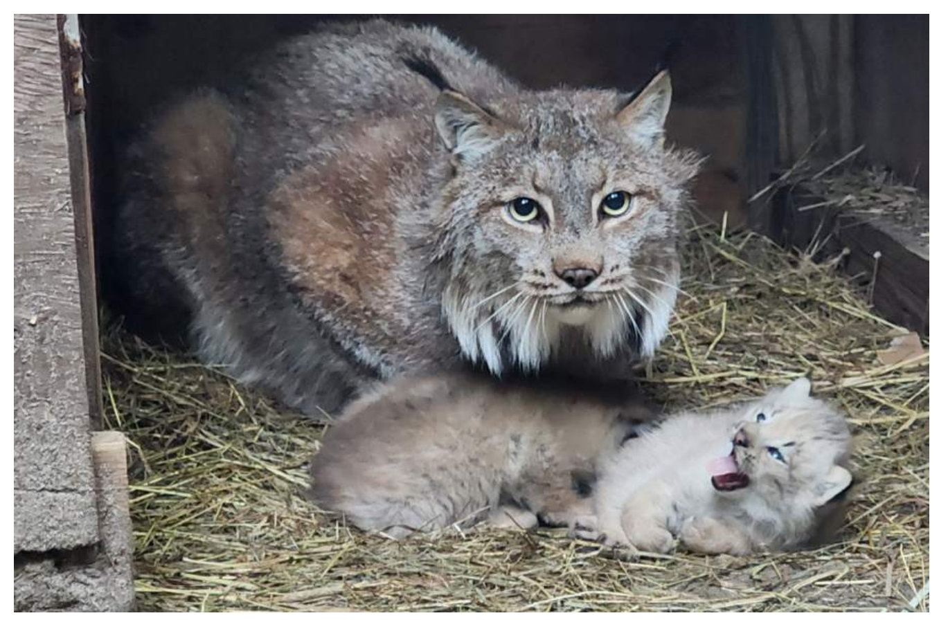
BP Z00 photo.