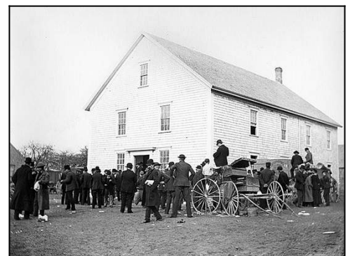
Meeting Houses like

They did not believe in doing good works for morality's sake, rather it was their faith that compelled them to do good for others. A few of their most basic beliefs are that the Bible is truth, each person has access to God through Jesus Christ and not through a hierarchical system of clergy, Jesus' life is to be emulated and His teachings obeyed, and that people are created equally.