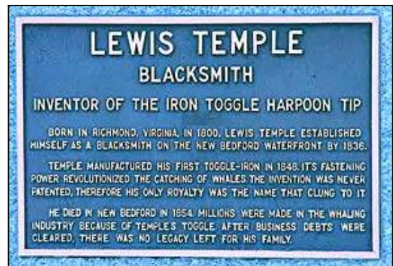
Lewis Temple Memorial Plaque

of Temple's injuries, but suffice it to say that it was a rather large one and his injuries were very severe.