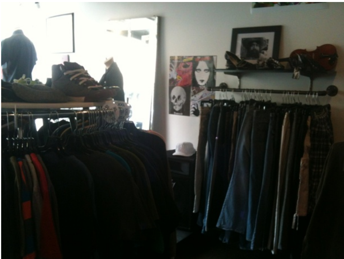
767 Exchange logo.