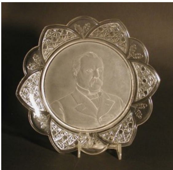
1884 Grover Cleveland Plate