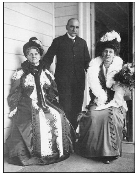
Wedding Portrait of Hetty Green, new husband Matthew Astor Wilks, and daughter Sylvia

by who he was married to, but also because Henrietta was one of those who actually invested in the company. Investors thought that the husband of the richest woman on earth who also had a financial interest, wasn't someone you would have to be concerned about defaulting on a loan on. When the house began to collapse, it was learned that the firm had actually loaned Edward money based on who he was wed to. Her primary bank tried to recover some of Edward's debts by seizing some of her assets. They certainly didn't know who they were dealing with!