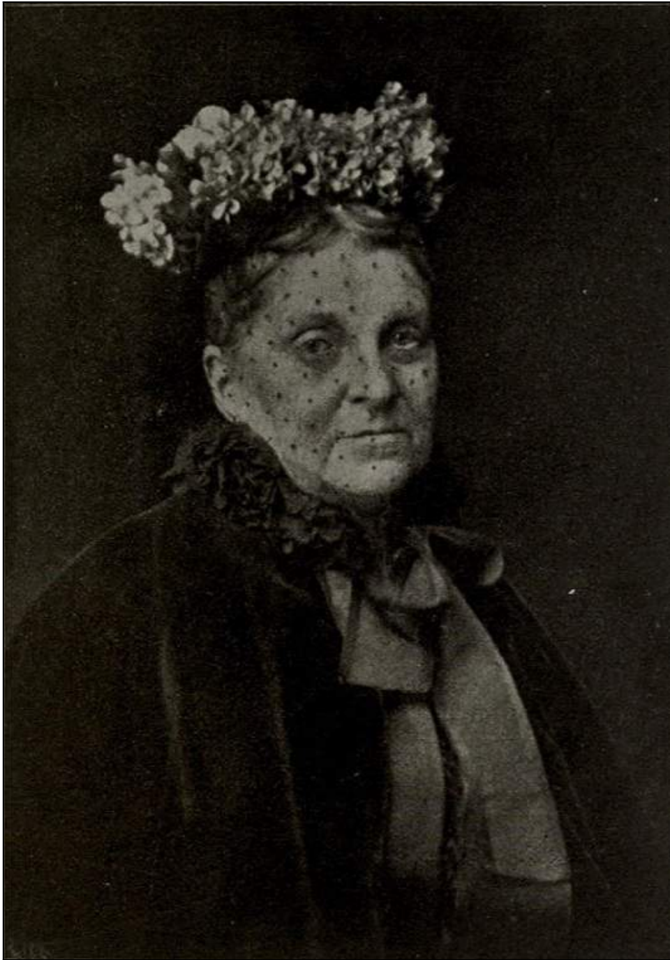
Henrietta Howland Green aka the "Witch of Wall Street"