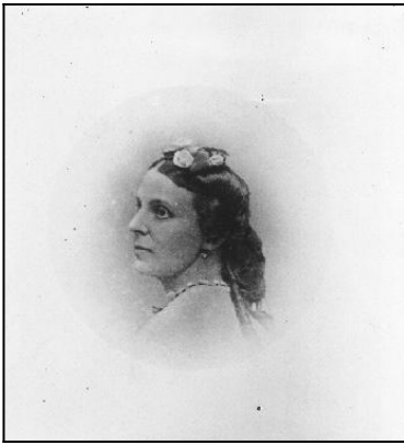
Hetty Green at 18 years old

Street", if it were not for her general appearance.