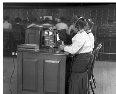
Women working at a Telephone Switchboard

The Iceman was another regular seen on the city streets. Before freezers and refrigerators, there was the iceman. The ice industry or frozen water trade as it was called, was a booming one in the 19th century. Indeed, it was a global one by the 1850s, and New England was a large source of ice. Many made a fortune cutting ice from ponds and lakes and using clever methods to store and transport it. Ice was cut in a variety of sized from 25-100 pound blocks and delivered by ice wagon throughout the day. While usually only the well-to-do could afford ice in their homes, meat handlers, butchers, fishmongers, and other jobs needed it to survive. This was a job that began at 4:00 a.m. to service businesses before they opened, worked until these businesses closed, and had to work seven days a week including holidays.