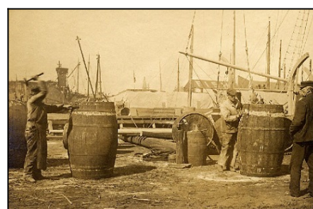
Coopers Hard At Work

In addition to being known as the Whaling City, New Bedford was also known as the City of Light for the sheer amount of lamp oil it produced in the 19th and 20th centuries from the whaling industry. This oil not only lit homes for practical and obvious reasons, but miner's headlamps served as added security within the streets, allowed mills and businesses to extend their hours of operation and increase revenue, and spurred progress. Originally these lamps used simple animal fat before being replaced with kerosene, gas, then electricity. Whale oil being the one that burned the best, with the least smoke and bad odor. Luckily for New Bedford, there was a whale ship or two putting around.