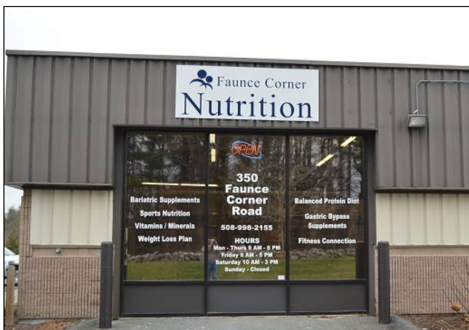
Faunce Corner Nutrition at 350 Faunce Corner Road, North Dartmouth across the street from VF Factory Outlet.

Are you one of those that hops from one diet to another? Trying any trend possible to trim off some weight? How about simply eating better or living a healthy lifestyle? Are you scheduled for bariatric surgery or have had it done already? Perhaps, you're an athlete looking to supplement your activities, whether weight training, tennis, soccer or Brazilian Jiu Jitsu?