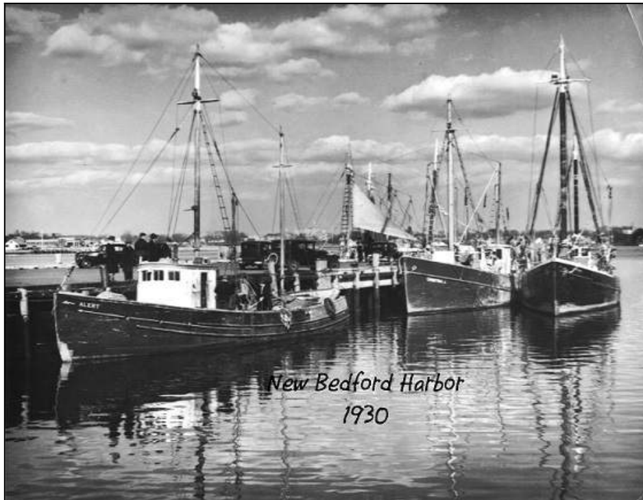
Old New Bedford Harbor in 1930(Rodney Avila)

The Dock-U-Mentaries Film Series continues on Friday, December 20th with a narrated slide show presented by Rodney Avila. Dock-U-Mentaries is a co-production of New Bedford Whaling National Historical Park and the Working Waterfront Festival. Films about the working waterfront are screened on the third Friday of each month beginning at 7:00 PM in the theater of the Corson Maritime Learning Center, located at 33 William Street in downtown New Bedford. All programs are open to the public and presented free of charge.