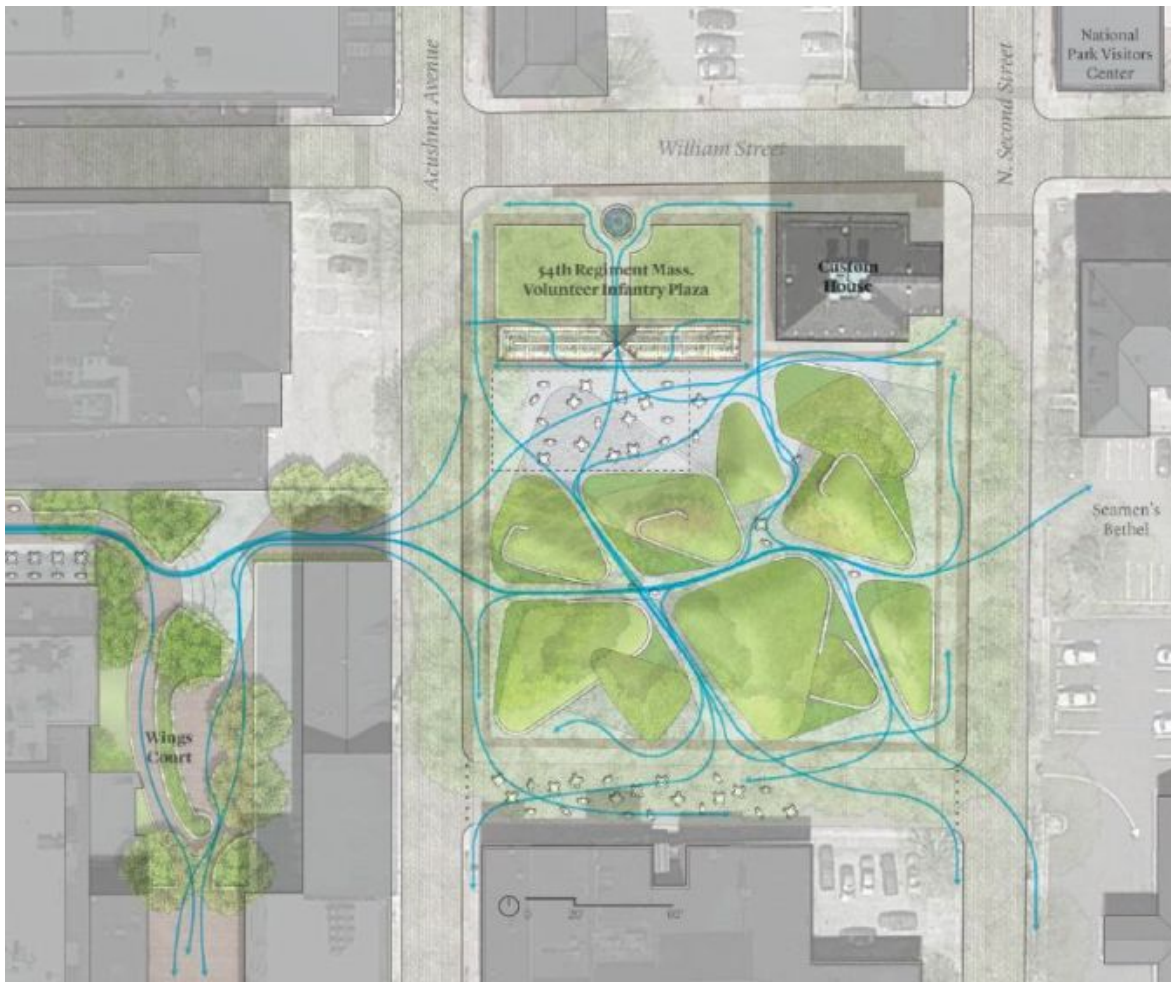
Wings Court and Custom House Square foot traffic flow.

3. The new Custom House Urban Park will be a place to read books and have lunch for 100s of New Bedford Residents at once. Currently, there is only a tiny sliver of grass near the water fountain between the Custom House Square Parking lot and William Street. This future park will significantly add grass, trees, seating and other features that will make for fantastic summer picnics, book reading and other outdoor activities. Here are some artist renditions of the future park, materials used and plant life.