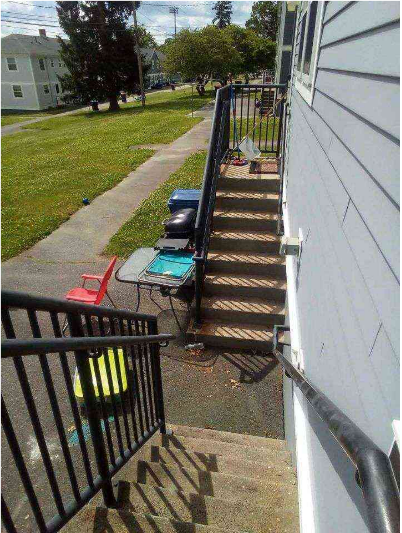
This is the backdoor stairs which is not the issue. We just avoid them and don't have an issue with them.