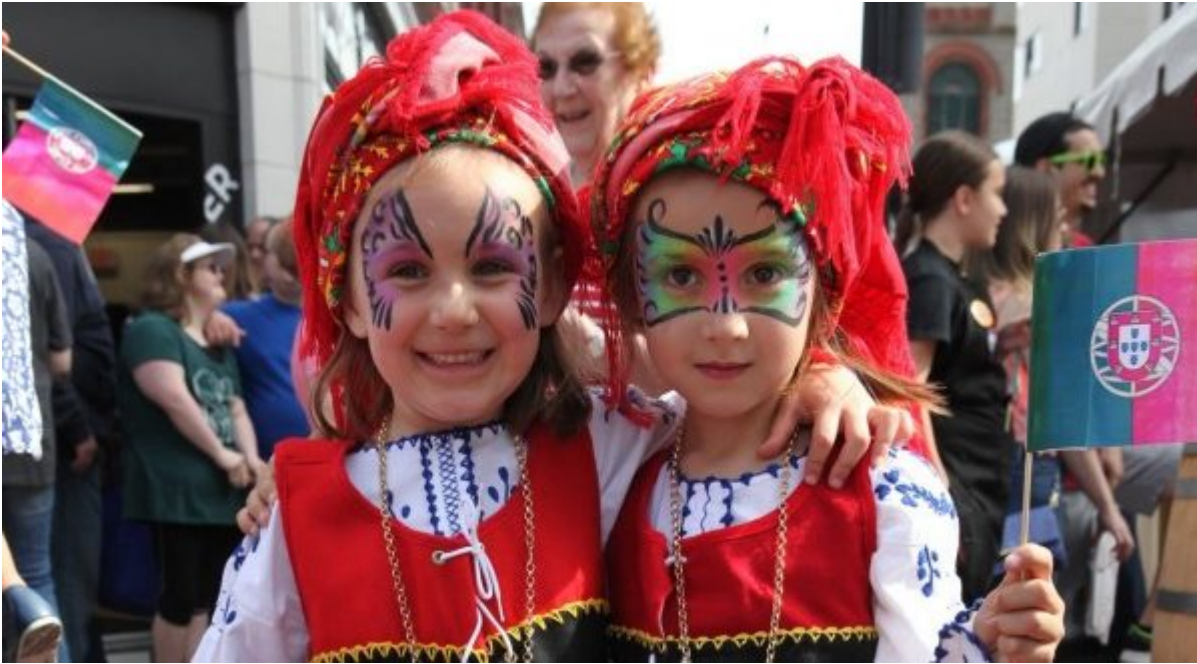
Feast of the Blessed Sacrament photo.