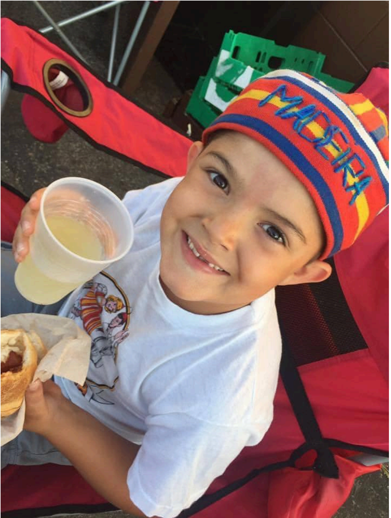
Feast of the Blessed Sacrament photo.