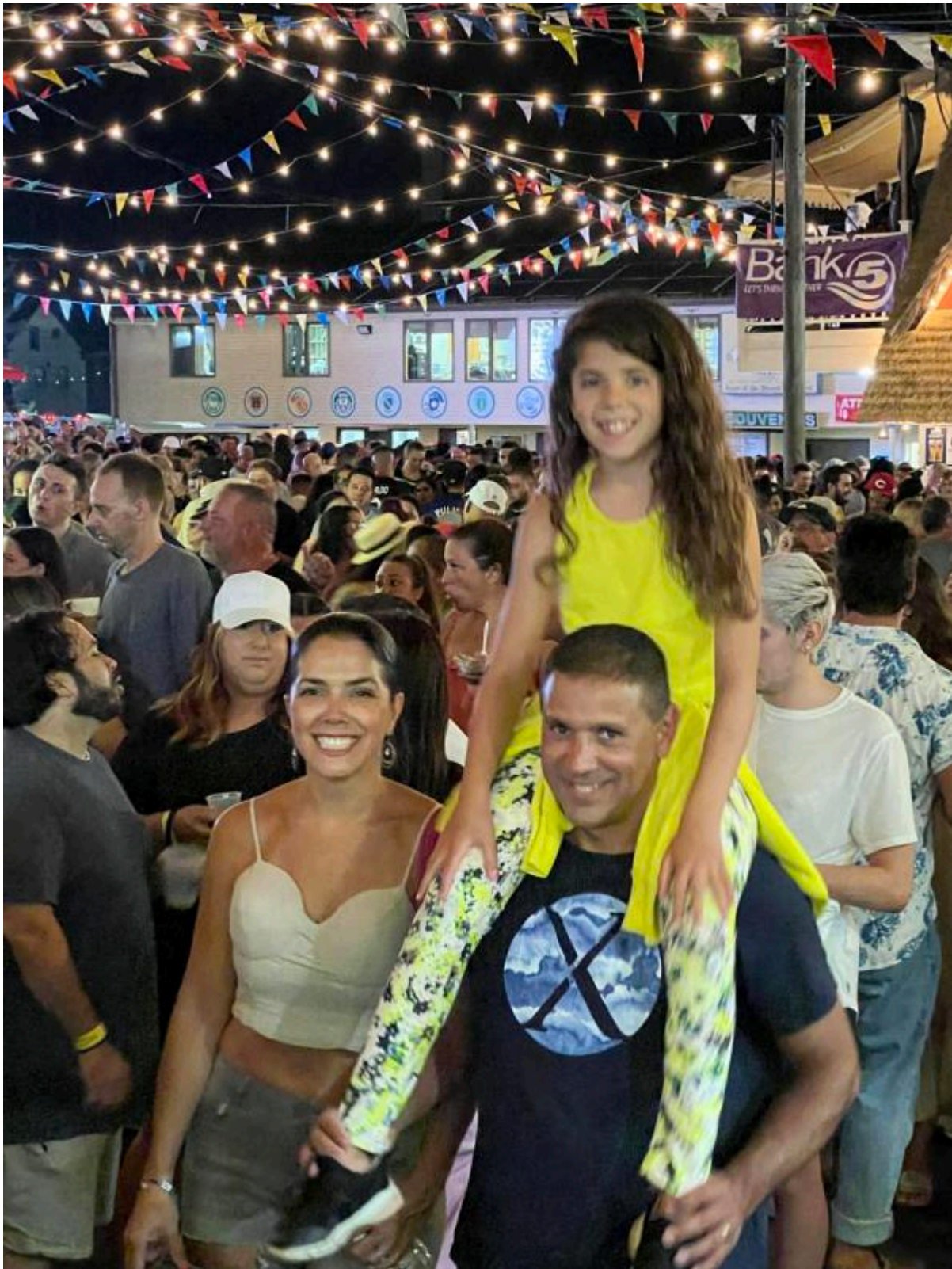
Feast of the Blessed Sacrament photo.