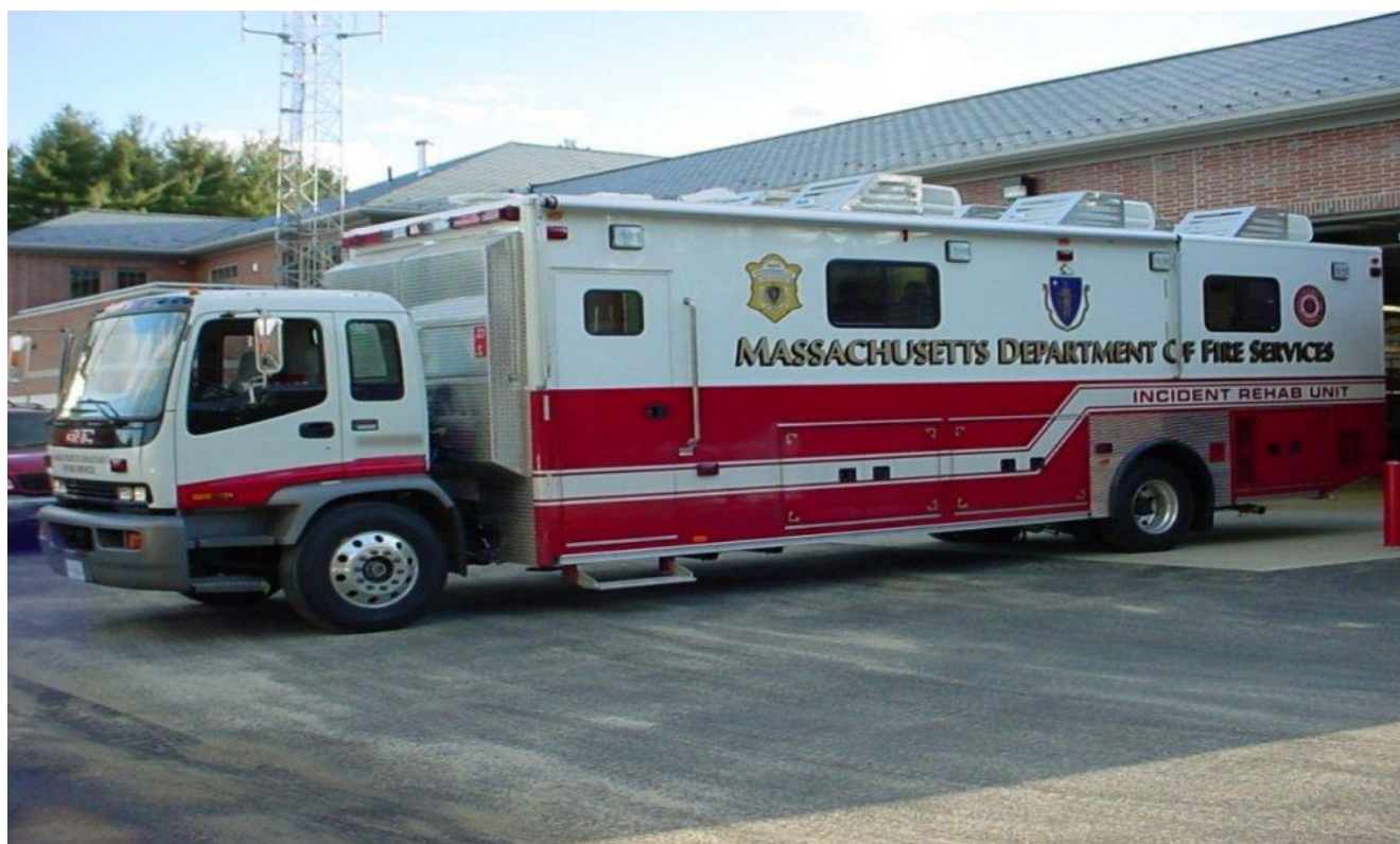
A typical Fire & Emergency Incident Rehabilitation Unit.

These services allow the Nbfd to be compliant with NFPA 1584 Standard on the Rehabilitation Process for Members During Emergency Operations and Training Exercises. EMA personnel also assist the Fire Investigators, American Red Cross, and NBPD and NBEMS with victim services and obtaining their information and needs.”-New Bedford Fire Department.