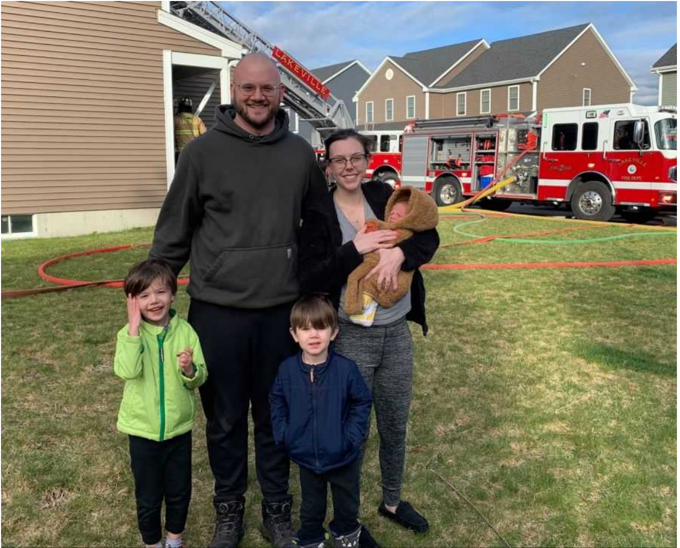
Lakeville, MA Fire Department photo.