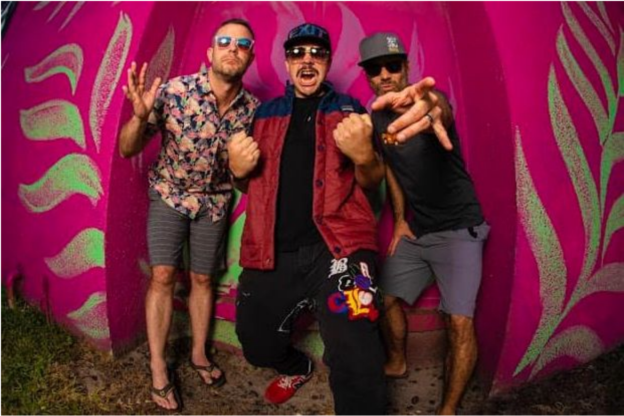
Feast of the Blessed Sacrament photo.