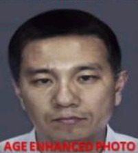
AGE ENHANCED PHOTO