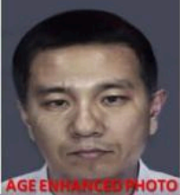
AGE ENHANCED PHOTO

Last known whereabouts is Quincy, MA in 2007