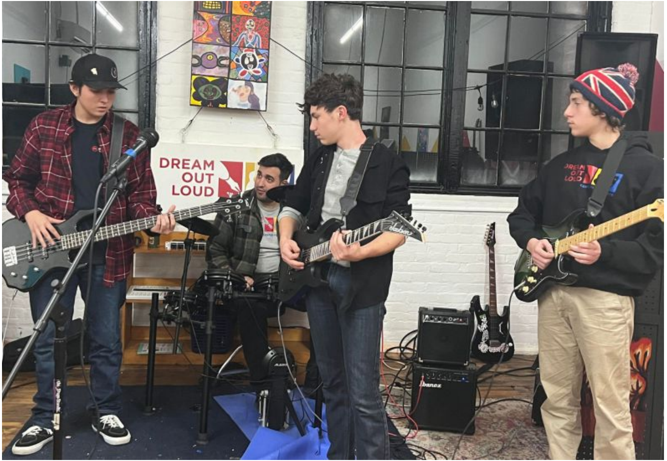
Dream Out Loud photo.