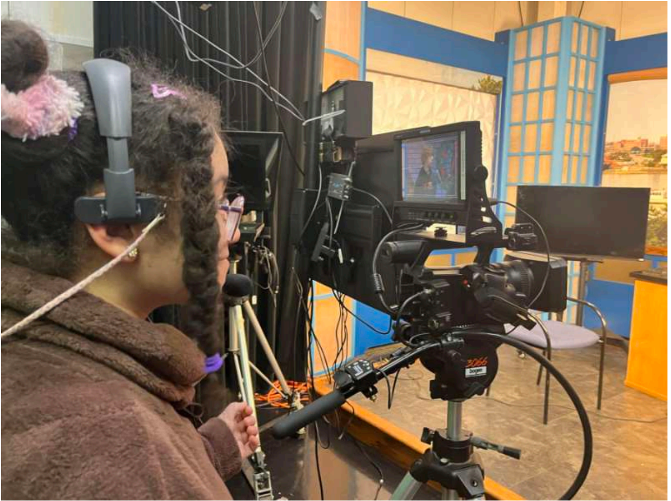
Dream Out Loud photo.