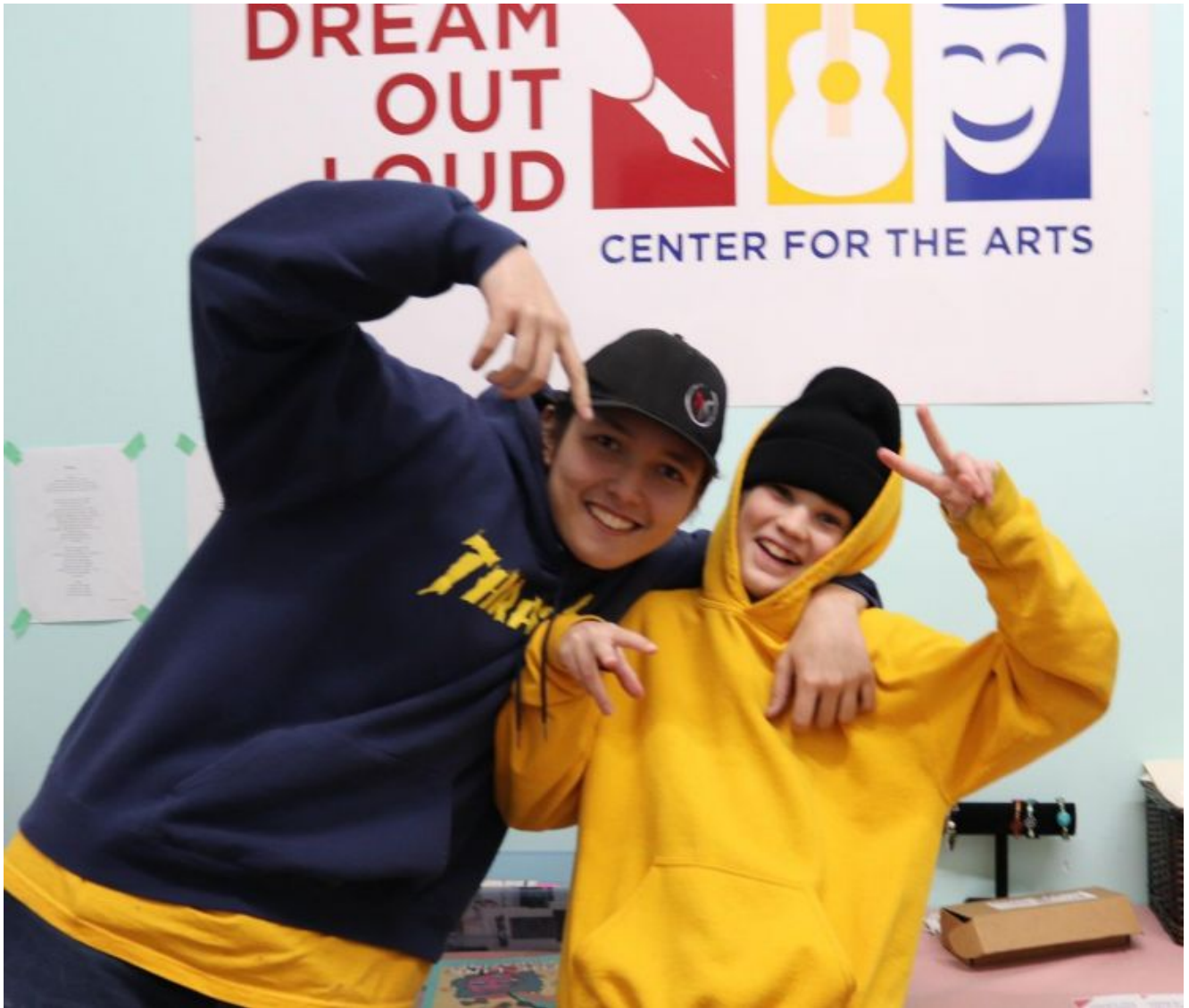
Dream Out Loud photo.