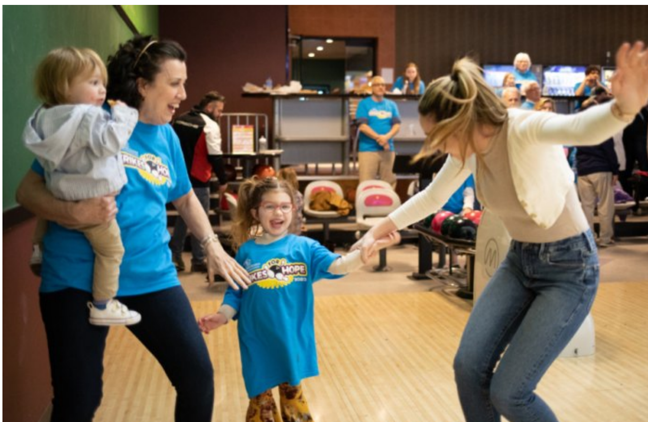
My Brother's Keeper photo.

This event will support the organization's core charitable programs of 36 years: furniture, food, and Christmas assistance. The mission of My Brother's Keeper is "To bring the Love and Hope of Jesus Christ to those we serve." My Brother's Keeper provides assistance to more than 62,000 children and adults throughout the South Coast and Southeastern Massachusetts each year.