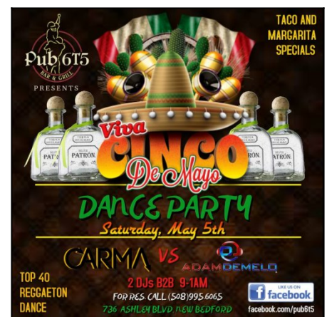
Cinco De Mayo Dance Party!

The third annual Viva Portugal! festa harnesses the power of The Z and 13 local Portuguese-American organizations for an event that lauds the culture and heritage of so many in our community. Four downtown New Bedford blocks will be filled with the sights, sounds and flavors Portugal, including lectures on the contributions of Portuguese-Americans, readings, live music, cooking demos, folkloric dance and more. Don't miss the free festa that's fun for the whole family!