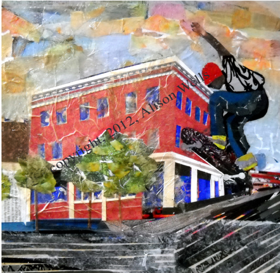
Red Sky at Night ... Sailors Delight.