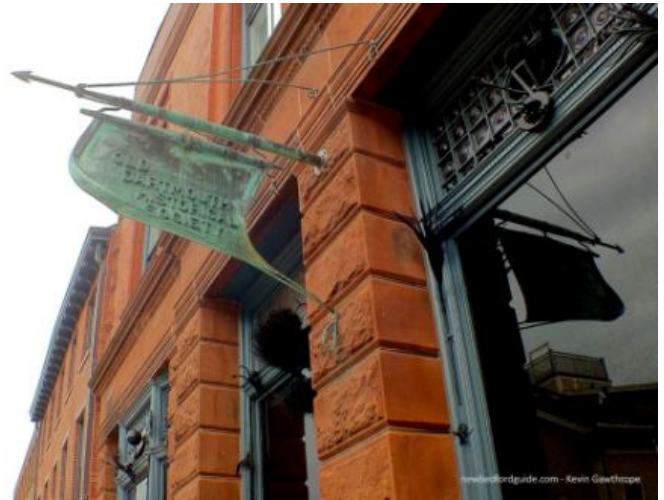
Old Dartmouth Historical Society

The 109th Annual Meeting of the Old Dartmouth Historical Society – New Bedford Whaling Museum will take place Friday, May 18 at 4:00 pm in the Cook Memorial Theater. Annual Meeting Day events include a memorial service for museum volunteers, a graduation ceremony for museum apprentices, and an exhibit opening and reception. The public is cordially invited to attend all events.