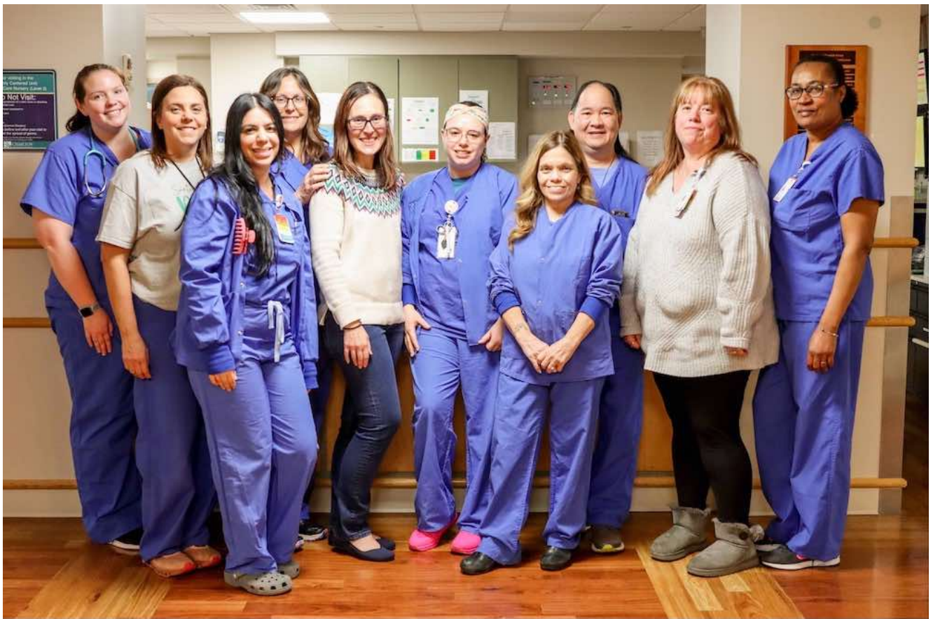
Medical Staff at Charlton Memorial Hospital in Fall River.

U.S. News & World Report, the global authority in hospital rankings and consumer advice, has named Southcoast Hospitals Group, including Charlton Memorial and St. Luke's hospitals, as a 2024 Maternity Care Access Hospital, an inaugural designation.