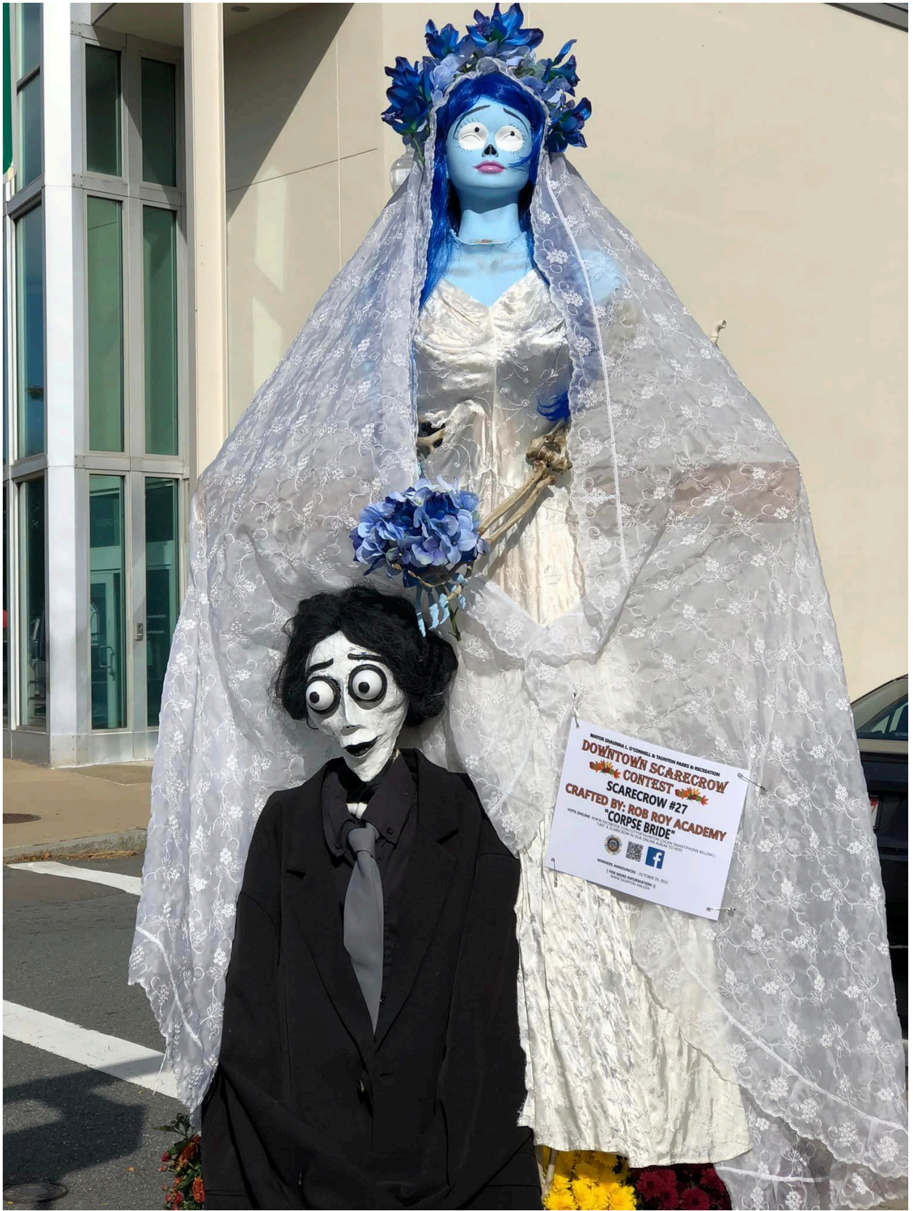
Crow-meo and Ghou-l-iette!