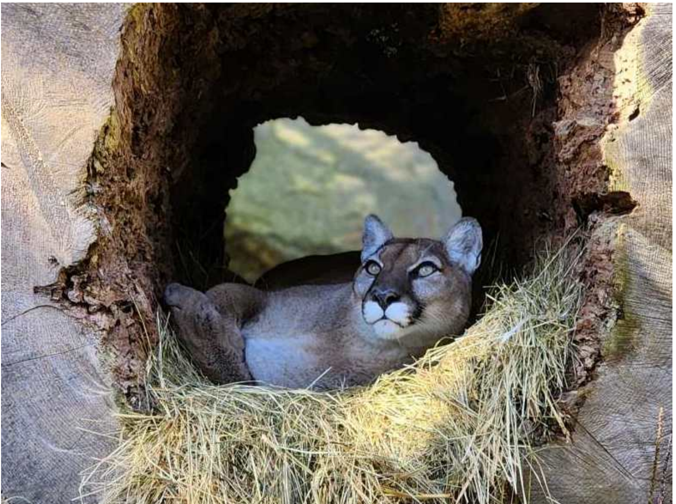
Buttonwood Park Zoo photo.