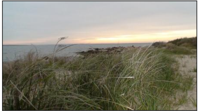
West Island Beach in Fairhaven