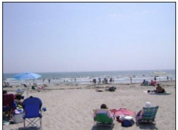
Horseneck Beach in Westport

If you grew up in Greater New Bedford then you are probably plenty familiar with the many beaches scattered along the shores. However, if you are a transplant to the area like myself, you may still be seeking new places to soak up the sun on your day off. Or perhaps you are planning on visiting New Bedford this summer and hoping to get in a swim during your trip. For New Bedford beach lovers new and old, I have put together a list of 5 beaches that are in the area that you might consider checking out.