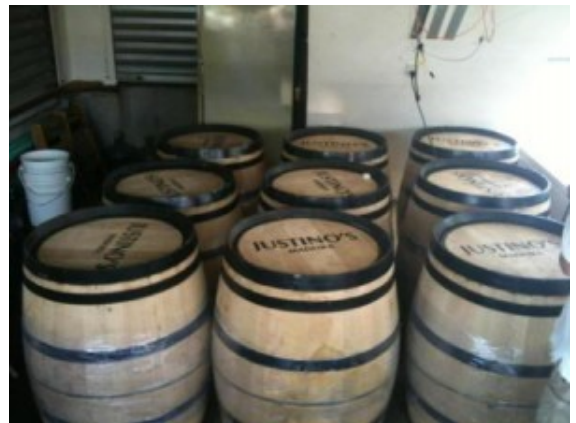
Madiera Wine at the Portuguese Feast in New Bedford

One of the great draws of the feast is the consumption of Madeira wine, which is a central part of the festivities as it is part of a long tradition. Madeira wine is a sweet, fortified red wine. Genuine Madeira wine is made on the island of Madeira, and exportation of actual barrels are restricted due to regulations. However, thanks to a special agreement made between feast officials and the President of Madeira, casks are able to be delivered to New Bedford and served for the weekend, making this a very rare treat for those who attend.