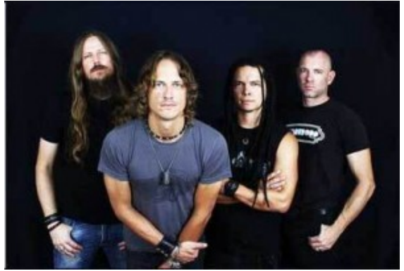
Fuel Headlines Thursday Night from 10-11 p.m.

There is a great deal of quality free entertainment at the feast each year from Portuguese and American cultures. There are three stages throughout Madeira field, and each host a variety of performance types throughout the weekend. In addition, the Museum of Madeiran Heritage will be featuring musical performances each night of the feast from 8- 11:30 PM.