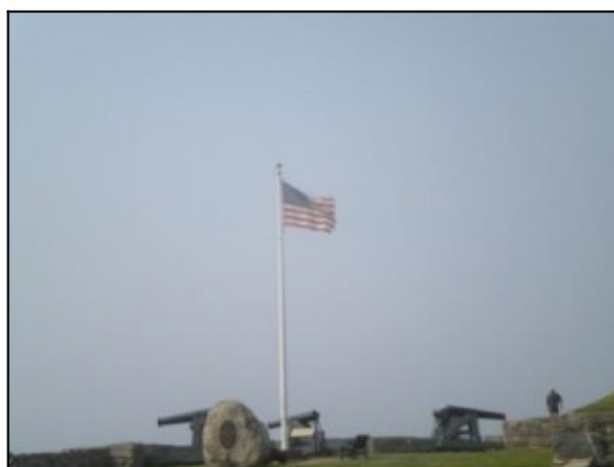
Fort Phoenix in Fairhaven

You may need to plan on walking a bit if it's a hot day and you arrive late.