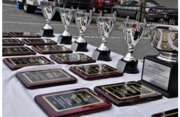
Winner trophies and plaques

For those of you who have never been, the Chowder Festival is a competition between the twenty-five participating restaurants. Over the past six years, local eateries have faced off to win 1st, 2nd or 3rd place in either the People's Choice Award or the Judge's Choice Award in five categories. The categories are; best clam chowder, seafood chowder, kale soup, stuffed quahog and table presentation.