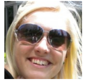
By Shonna McGrail R yan

This year's New Bedford Seaport Chowder Festival may have been interrupted by rain, but as we all know, inclement weather will never come between New Englanders and their "chowda." For 2012's Seventh Annual Chowder Festival the crowds packed in as usual to try samples of clam chowder, seafood chowder, kale soup and stuffed quahogs from some of the South Coast's best local eateries.