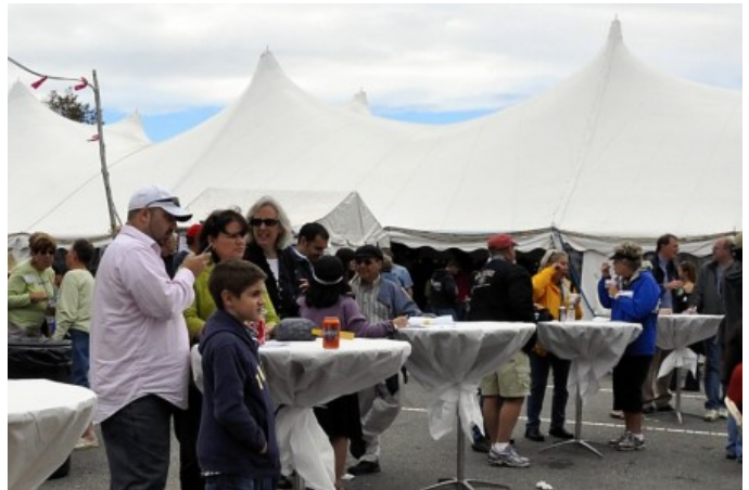
Custom House Square

As always, the Chowder Festival takes place under a large tent covering Custom House Square in downtown New Bedford. The tent allows for the event to resume come rain or shine. This year the Festival will be on Sunday October 7th, which is the day before Columbus Day. The combination of a three day weekend and cool early fall time weather should allow for people to be able to enjoy themselves all day long.