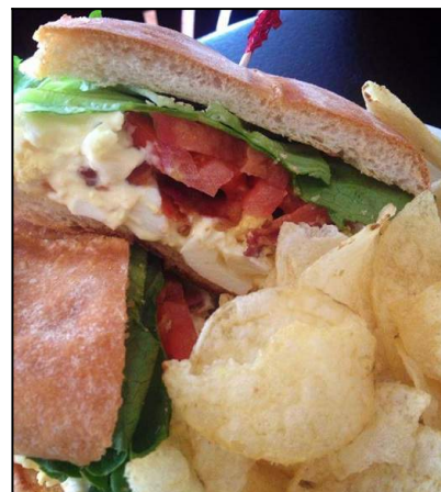
Tia Maria's European Cafes BELT: Bacon, Egg Salad, Lettuce & Tomato!

offer outside seating, and I was able to indulge in great food from another culture especially when I tried their Turkey Reuben with their own homemade dressing.