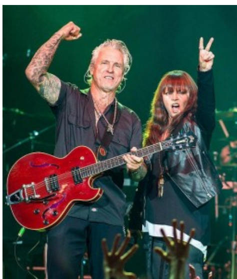
Pat Benatar & Neil

Every single song was greeted by audience members leaping to their feet, singing along to every word and chanting every chorus. The night was lively and upbeat, even the security guards were dancing. The duo took a moment to recognize their own relationship with an anecdote of the first song they ever wrote about their experiences together in love, introducing “Promises in the Dark”.