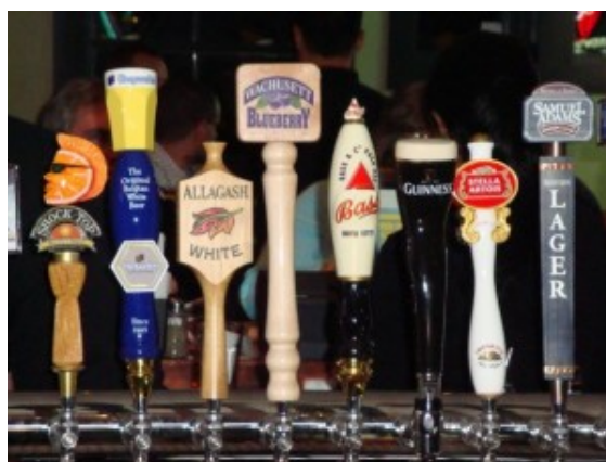
A selection of beer on tap at Rose Alley.