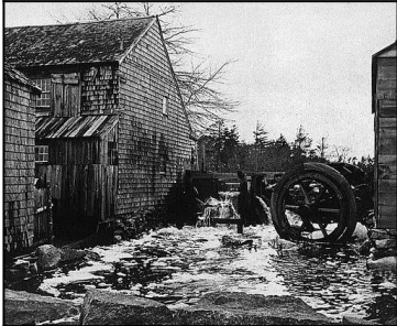
Old Cummings grist mill

of shoes, one iron pot, and ten shillings...” Though made official in November, the land was unofficially purchased 6 months prior on March 7. While the exchange seems like a pittance, these things were incredibly valuable to the Wampanoags.