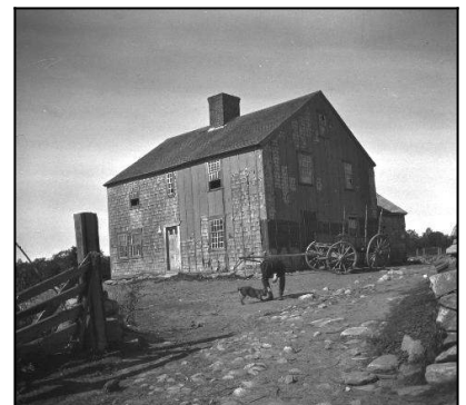
Increase Allen House south of Bald Hill meeting house, nearly 1 mile south

These garrisons were often simply isolated, fortified homesteads, which is what Dartmouth was comprised of early on. The garrisons eventually grew into hamlets, villages and townships. Some of the very first being in Nomquid known as Russells Mills, Slocum Neck, and Smith Neck.