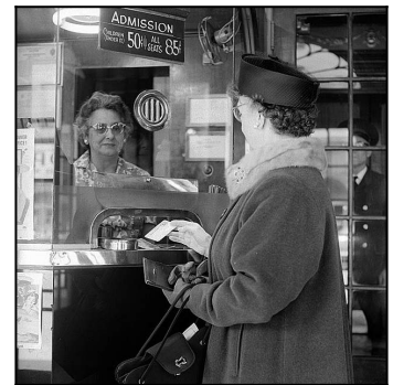
Typical Movie Theater Entrance. Note: 85 cents!

to have theater licenses willy-nilly was a bit too much. New Bedford's citizens voted 12-566 against any more theatrical licenses. This illustrates how prevalent and powerful religious thought was in that day. Either New Bedford's citizens were secretly visiting these venues because it would shame their family or much of the revenue generated at the events were from infidel and heathen out-of-towners. The likely story is that a bit of both was true.