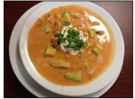
Sopa de Tortilla – A spicy Mexican soup with crispy fried strips of corn tortillas, cheese, and avocado in a chicken stock.

There is a lot of commonality like chocolate, chilis, cinnamon, clove, etc. but there is plenty of room for regional differences. All versions are luxuriant, rich and complex. I am a through and through, bonafide mole junkie. When mole is on the line, I will drop everything – it's a just got "real" moment for me. Mole is serious business, indeed. It is to Mexico as red sauce is to Italy, or curry is to India. Mole is a part of Mexico's history and can't be separated. There are as many moles as there are people in Mexico and everyone will declare that their abuela makes the best. "Fact."