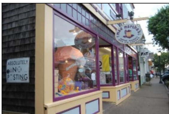
Mad Martha's Ice Cream, on Circuit Avenue.

After dinner comes desert for us, so we head over to Circuit Avenue where there are many ice cream shops to choose from. The most famous is Mad Martha's , but there is also Ben and Bill's Chocolate Emporium and the Carousal . All of them are great and the portions are huge, but they are pricey: You can expect to pay about $4.00 or more for a cone. Since I don't have a favorite ice cream shop, I go to the one with the smallest line. This is important because during the summer the lines can be out the door.