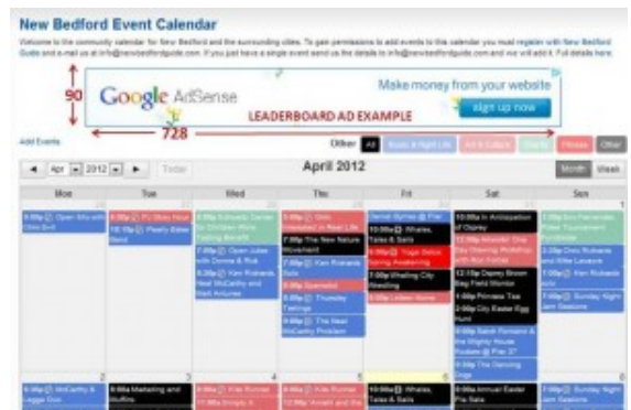
Example Ad Spot – Click to Enlarge

At the end of January, 2012, New Bedford Guide launched a FREE community event calendar. The calendar and example ads can be seen at http://www.newbedfordguide.com/calendar . The calendar quickly became one of the most popular calendars in New Bedford and Southeastern Massachusetts with hundreds of events being uploaded monthly from dozens of organizations and individuals.