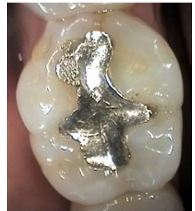
Example of an amalgam filling.

Like millions of other Americans, I got tons of cavities when I was a child and had several "silver" fillings or amalgam fillings. As a child, you really do trust your doctor or dentist. Through my younger years, the dentist put seven amalgam fillings in my mouth. I recently got them all removed and luckily my dental insurance covered it. I removed them because as you eat hot foods, you heat up the amalgam fillings and release mercury into your mouth and digestive system.