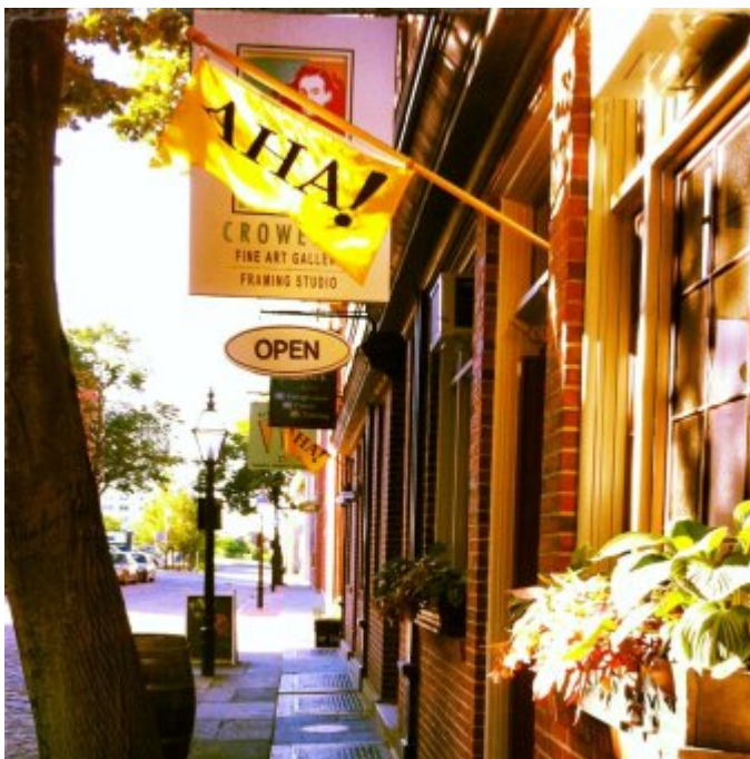
Figure out exactly what you like being part of. What do you enjoy doing? Live music? Viewing art? Learning history? AHA stands for "art, history and architecture", so that will be a part of every night. By knowing what your interests (or the interests of the group you are with) are, you can make informed choices ahead of time and see things you know you will enjoy.

Let's start from the beginning: You can't enjoy AHA! Night, if you miss it. I, myself, didn't begin to attend AHA for years, simply because I forgot WHEN it occurred. It's a good idea to circle the date on your calendar, program a reminder in your phone, etc. so you can be notified when the second Thursday of the month rolls around. Ahanewbedford.org has a mailing list that gives you plenty of notice before the night arrives; as well as informing you of the specific events that will take place! You can also find AHA Night on Facebook, Twitter and Flickr.