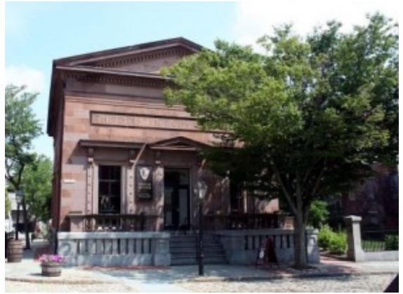
New Bedford Visitors Center (33 William Street).

The Whaling History Alliance, the official fundraising organization for New Bedford Whaling National Historical Park, will host an afternoon of family-friendly activities in celebration of the 15 th Anniversary of New Bedford Whaling National Historical Park on Saturday, September 8.