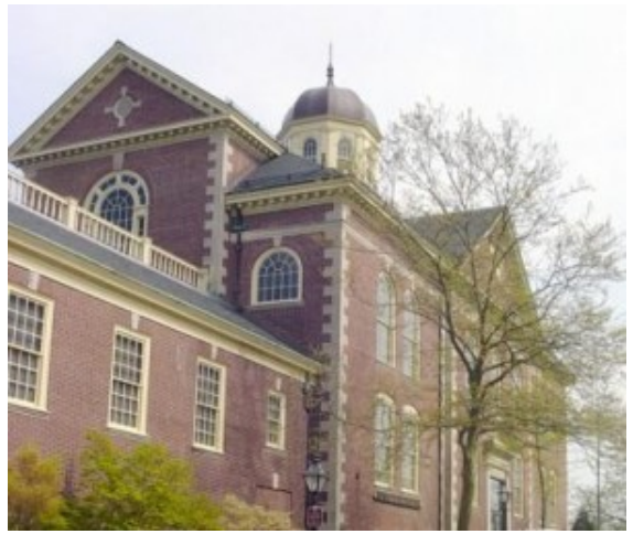
New Bedford Whaling Museum.

In honor of the National Park's 15 th Anniversary celebration, the New Bedford Whaling Museum will host an afternoon of free activities between the hours of 2:30 and 5 p.m. The following activities will take place on the Museum plaza.