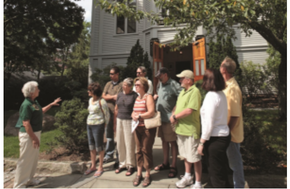
Tour stop in front of the Seamen's Bethel.

New Bedford has a long and fascinating history, filled with stories of whalers going to sea for years at a time, wives left to run businesses, escaped slaves seeking freedom, and a connection to the sea that spans centuries. The public is invited to explore this history through free guided tours, offered weekends (Saturday and Sunday) at 10:30 AM and 2:30 PM. Tours leave from New Bedford Whaling National Historical Park's visitor center, at 33 William Street in downtown New Bedford.