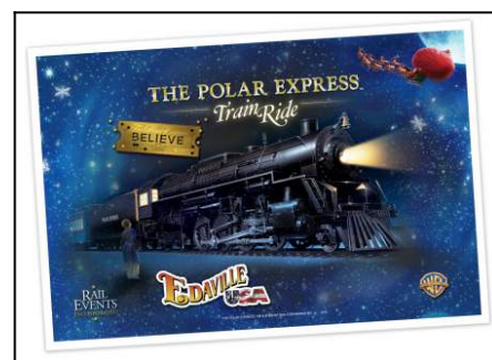
Polar Express Ride (and XMas Festival of Lights) during Military Appreciation Weekend!

The glitter of gold and the sparkle of silver will dazzle you as you tour three magnificent mansions decked out in Yuletide finery. Music, tours, and spectacular decorations highlight the celebration of Christmas at the Newport Mansions. For more information, click on event title.