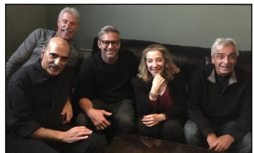
Girl Friday at PUB 6T5!

Features thousands of lights displayed on the trees and unique features of Ballard Park's three acre quarry meadow. Event goers are advised to wear appropriate shoes or boots as the trail may be dark, muddy and uneven in places. The event may be accessed at 21 Hazard Road. Park in the Rogers High School parking lot and walk down Hazard Road. Bring a flashlight. Ballard Park, 21 Hazard Rd & Wickham Rd., Newport, RI.