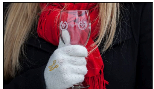
22nd Annual WINETERfest

Whip your body, mind and spirit into shape! 9:00am – Fitness: Zumba Sculpt, 10:00am – Mindfulness, 10:30am – Yoga, 11:00am – Hypnotism Smoking Cessation, 11:30am – Qigong, 12:30pm – Nutrition. Boys & Girls Club of Greater New Bedford, 166 Jenney St., New Bedford.